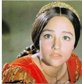
Olivia Hussey as Juliet